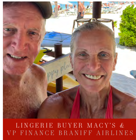
LINGERIE BUYER MACY'S & VP FINANCE BRANIFF AIRLINES