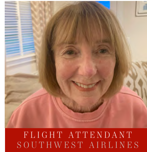
FLIGHT ATTENDANT SOUTHWEST AIRLINES