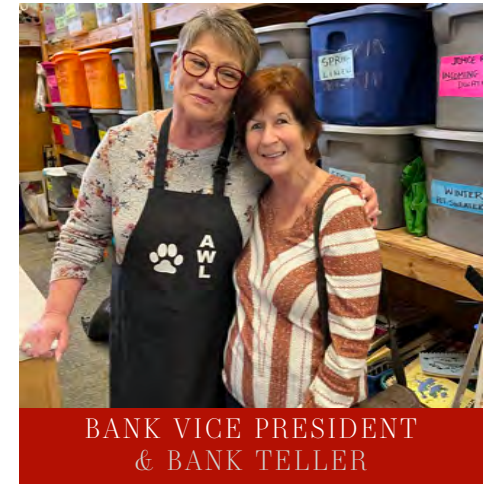
BANK VICE PRESIDENT & BANK TELLER