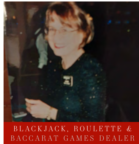
BLACKJACK, ROULETTE & BACCARAT GAMES DEALER