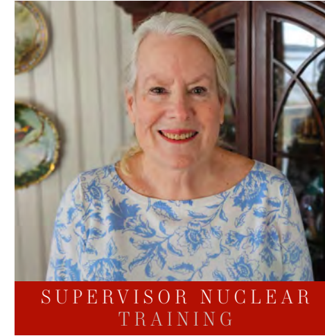
SUPERVISOR NUCLEAR TRAINING