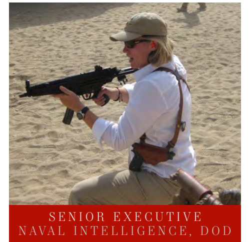
SENIOR EXECUTIVE NAVAL INTELLIGENCE, DOD